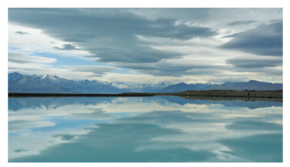
Fig. 2. Southern Alps and Lake Pukaki - "Misty Mountains and Middle Earth"

The main area of the South Island related with film tourism is massif of the Southern Alps. This mountain range is often called The home of the Lord of The Rings and Hobbit trilogies.