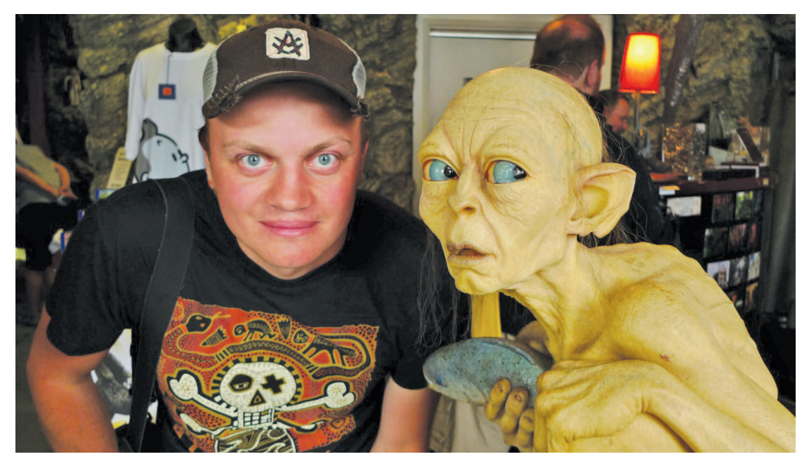
Fig. 3. Meeting in the Middle Earth with Gollum (author on the left), The Weta Workshop Wellington, source: Apollo M.

New Zealand has much more places associated with Tolkien and trilogy The Lord of the Rings. Other location of shot movies can be found in Nelson, Canterbury, Mackenzie Country, Southern Lakes and around the capitol Wellington. Visitors can feel for a moment like a visit the land of tales and legends which guarantees unique memories. The main problem for potential tourists is location of the country at a considerable distance from large centers of population in the world. Long flight can be tiring, so well prepared trip on the trail of The Lord of the Rings can begin at the departure airport of tourist.