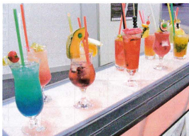
The samples of the drinks presented at the competition