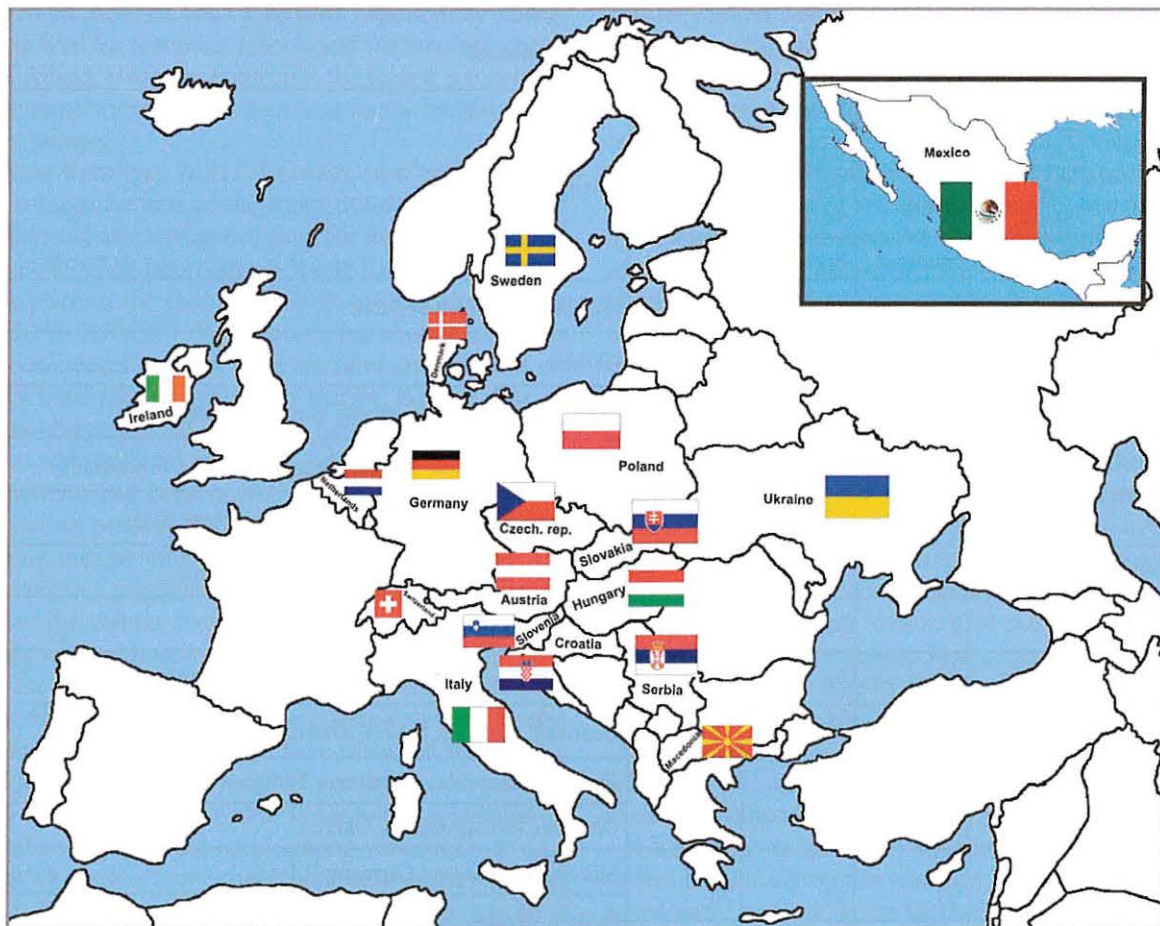
The map of countries that participated in Eurocup