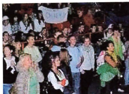
Excited supporters