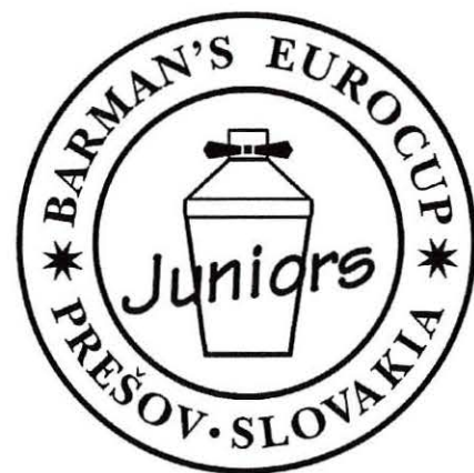
The logo of the competition

EUROcup, the unique international junior bartenders' competition, began to write its history in the school year 1992/1993. Many successful achievements of the Hotel Academy in various gastronomy exhibitions and competitions in the former Czechoslovakia and abroad had preceded EUROcup.