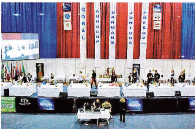
The competition scene with 10 bar stations

The event is carried on under the patronage of AEHT – European Association of Hotel and Tourism Schools, the Slovak Bartenders Association and Prešov Region. In the year 2004 the European Association of Hotel and Tourism Schools, that has its seat in Luxemburg, included the Competition EUROcup at the Hotel Academy in Prešov in the official calendar of the events, and, as a co-organizer, provides financial assistance. The leading representatives of the AEHT – the general secretary, vice presidents and members of the Supreme Committee paid a visit several times. Experts from Slovakia and from foreign countries appreciate the high Professional standard as for the preparation, organization, the bartenders' performance and the whole course of the event.