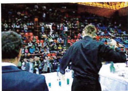
View of the audience